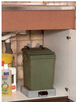
Placed under the sink unit.