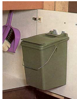
Mounted on furniture's door